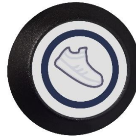
New Foot switch

New improved Proximity switches, up to 70mm range with full hand, a finger will trigger before contact, approached from any angle. ideal alternative to Push Pads.